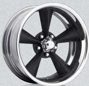
U203 STANDARD MATTE BLACK TEXTURE