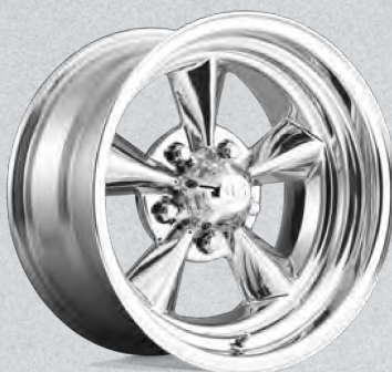
U201 STANDARD POLISHED

From there, we can accurately place your center into the rim at any chosen offset. We'll handle the robotic welding to ensure your wheels fit perfectly, giving you the custom look and finish your vehicle deserves.