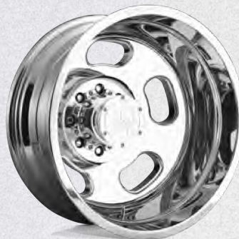
U433 INDY HD SERIES DUALY CUSTOM FINISH