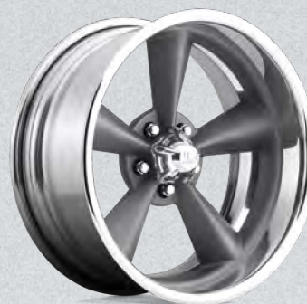
U204 STANDARD MATTE GUNMETAL TEXTURE