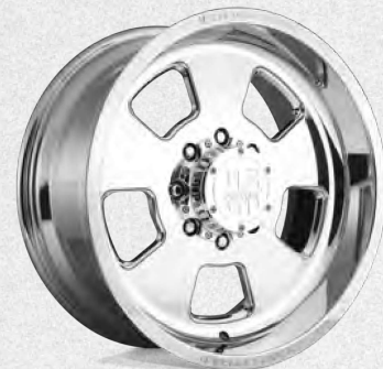
U390 SPEEDWAY HD SERIES CUSTOM FINISH