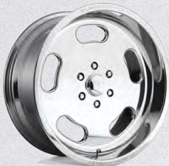
U433 INDY HD SERIES CUSTOM FINISH

DUALY: 20x8.25, 22x8.25, 24x8.25, 26x8.25, 28x8.25